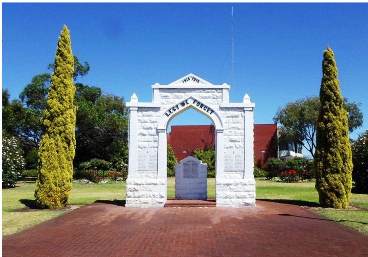
Cannington War Memorial