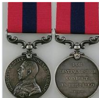
Distinguished Conduct Medal (D.C.M.)

During the First World War, concern arose that the high number of medals being awarded would devalue the medal's prestige. The Military Medal was therefore instituted on 25 March 1916 as an alternative and lower award, with the Distinguished Conduct Medal reserved for more exceptional acts of bravery. ( Wikipedia )