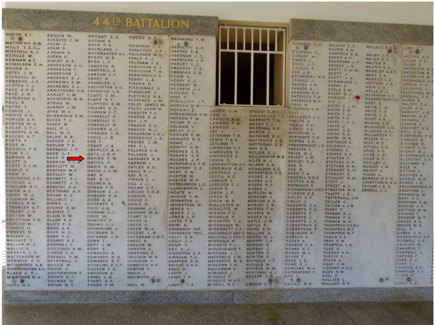
44th Battalion Panel